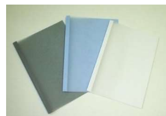
Easy bookbinding file

For the Final submission after the defense, please submit 1 booklet with a formal bookbinding with double-sided printing (e.g. Kurumi Seihon くるみ製本).