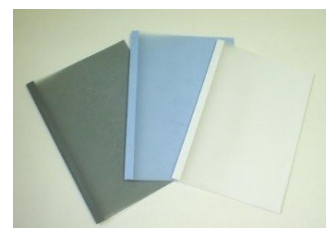
Easy bookbinding file

For the Final submission after the defense, please submit 1 booklet with a formal bookbinding with double-sided printing (e.g. Kurumi Seihon くるみ製本 ).